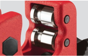
Chrome Roller Rust Protection