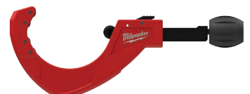
3" Quick Adjust