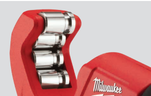
Chrome Rollers Rust Protection