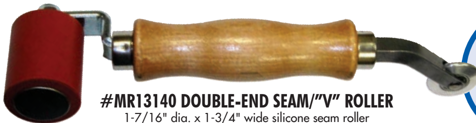
#MR13140 DOUBLE-END SEAM/"V" ROLLER 1-7/16" dia. x 1-3/4" wide silicone seam roller with a 1-1/8" x .196" aluminium "V" roller

We combined the MR05020 and the MR13110 into one great tool!