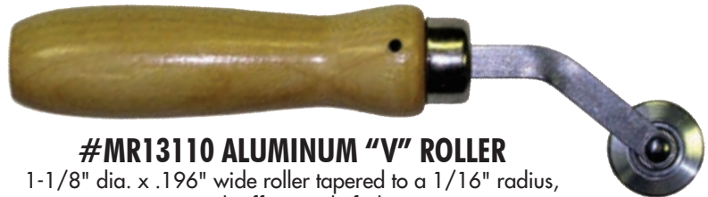
#MR13110 ALUMINUM "V" ROLLER 1-1/8" dia. x .196" wide roller tapered to a 1/16" radius, with offset single fork

We combined the MR13500 and the MR13110 into one great tool!