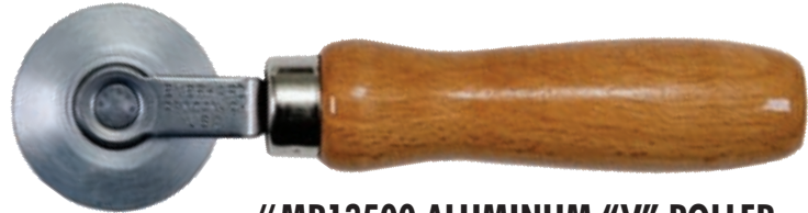
#MR13500 ALUMINUM "V" ROLLER 2" dia. x 1/2" wide aluminum roller tapered to a 5/64" radius, with straight double fork